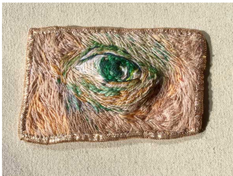
Gavin Fry: EYE PATCH | 2018 10cm x 5.6cm hand embroidery on cotton with lurex. Description: an eye patch for Vincent.