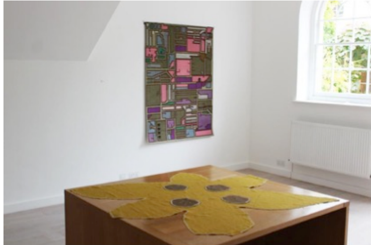
Front: Barry Flanagan, Tablecloth . Back: Lucienne Day, Plan of Peking

Copyright © 2018 The 62 Group of Textile Artists, All rights reserved.