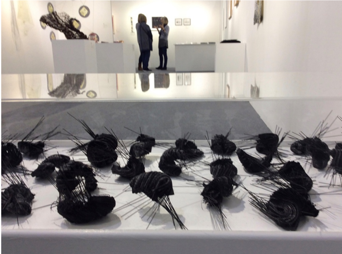
Knitting and Stitching Show, Edinburgh 2017